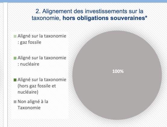
This graph represents 100% of total investments.

For the purposes of these charte "covergian hande" include all sovergian exposures