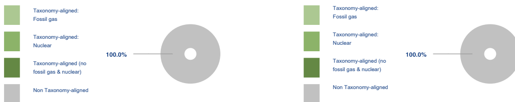
This graph represents 100% of total investments.

The two graphs below show in green the minimum percentage of investments aligned with the EU taxonomy. As there is no appropriate methodology to determine the taxonomy-alignment of sovereign bonds*, the first graph shows the taxonomy alignment in relation to all the investments of the financial product, including sovereign bonds, while the second graph shows the taxonomy alignment only in relation to the investments of the financial product other than sovereign bonds.